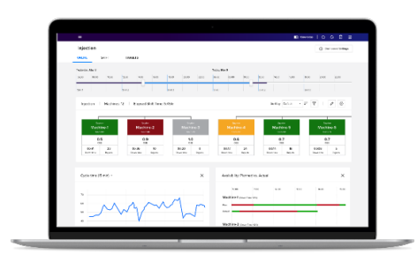
Production Engineer view

Matics brings your team together, anywhere and anytime to collaborate, manage and track work throughout the production process.